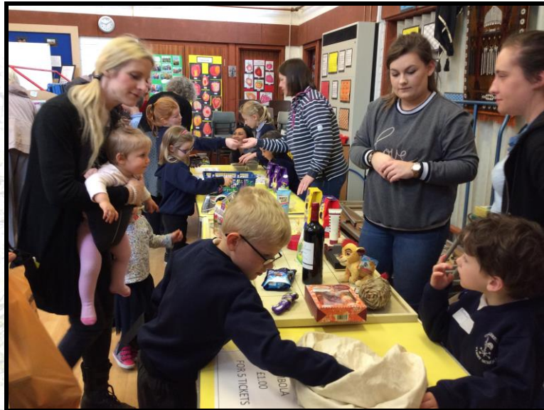
Easter Fair organised by the P.T.F.A.

Chollerton First School has a very supportive Parents, Teachers and Friends Association which meets for social events, fund raising, fostering home/school links and for Curriculum information events. All parents are automatically welcomed into the P.T.F.A.