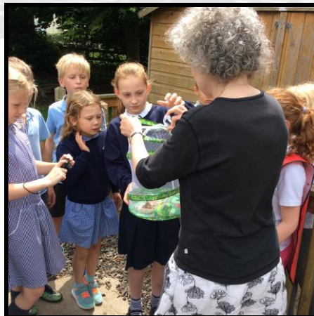
Class 2 releasing butterflies

We ensure breadth of learning and progression throughout a child's First School years and through liaison with Hexham Middle Schools have ensured an appropriate grounding for our children's future experiences at Key Stage 2.