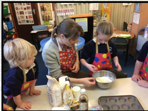
First Aid, Gardening & Cookery Clubs

Children are given opportunities during the school day to work in a gardening club and to develop mental health and well-being and cookery.