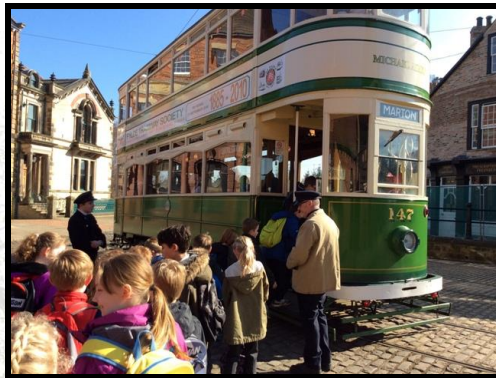
School visit to Beamish Museum

At Key Stage 2 children go on to study the history of their local area, the Romans, the Ancient Greeks and Ancient Egyptians.